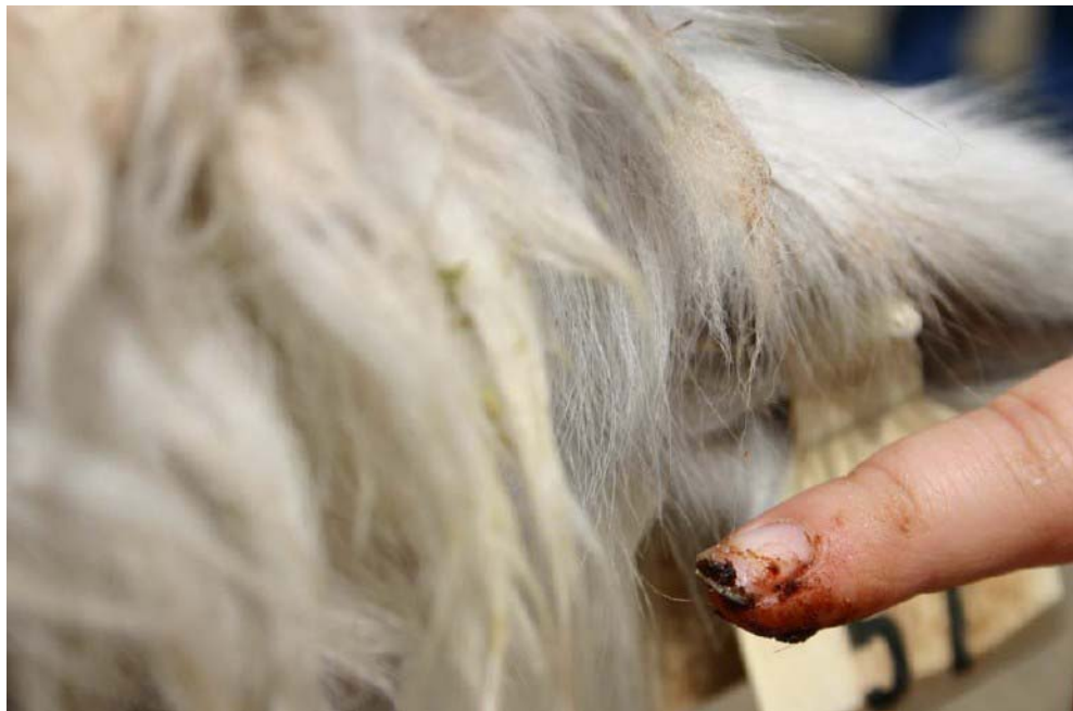
Ex. D Mites in the ear

All of the above mites bite and suck, leaving behind a trail of red, itching, thickened skin that often creates puss pockets similar to a mild case of teenage acne. Many alpacas will have mites in their ears, which they will drop to the side of their head and scratch with their hind foot. Always check the inside of the ear to see if a black waxy substance is present (this condition can also be the result of ear ticks). This material is mite or tick feces and indicates a need for treatment. As bad as this condition looks, it can be cured in a fairly straight-forward fashion. But first we need to march on to the munge.