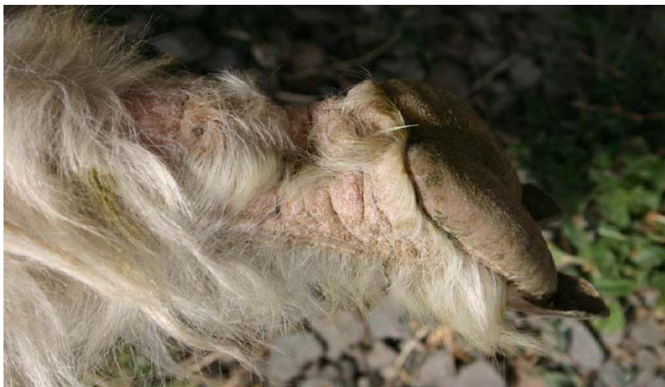
Ex. C Hair loss on ankles

The skin condition in question is familiar to most alpaca owners – loss of hair on the nose and face, loss of hair at the ankles (Ex. C), or scabby skin in the hairless areas on the belly. This is accompanied by varying degrees of red thickened skin and puss-filled pimples in the hair loss areas and crusty ears with gobs of black, waxy material in the ear canal. (Not all symptoms appear at the beginning, in advanced cases this ear condition can turn into a foul-smelling, puss-filled infection.)